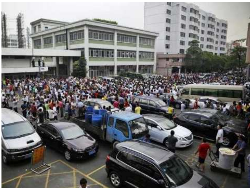
A Picture of the Protesting Workers.

The Yue Yuen strike represents a significant moment in which workers at the factory have realized their rights and have acted collectively to protect their interests. The demands raised by Yue Yuan workers reflect issues faced by most workers in China's manufacturing industry, and the resolution of this dispute will become an important precedent.