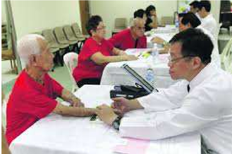
Elderly Patients Having Check-Ups at Kwong Wai Shiu Hospital.

Where are Human Rights for the Elderly? The Face of Poverty Ages is Increasing in Asia.