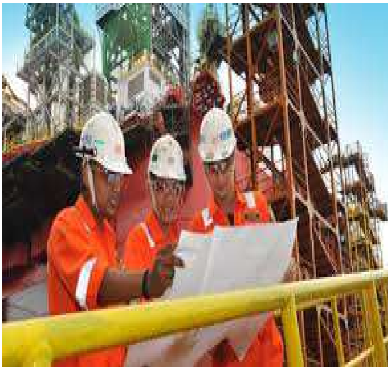
Workers in a Building Yard in Singapore.

At the launch of this year's Workplace Safety and Health Campaign, Deputy Prime Minister Tharman Shanmugaratnam said that more efforts have to be done in order to improve workplace safety and manage health risk for workers.