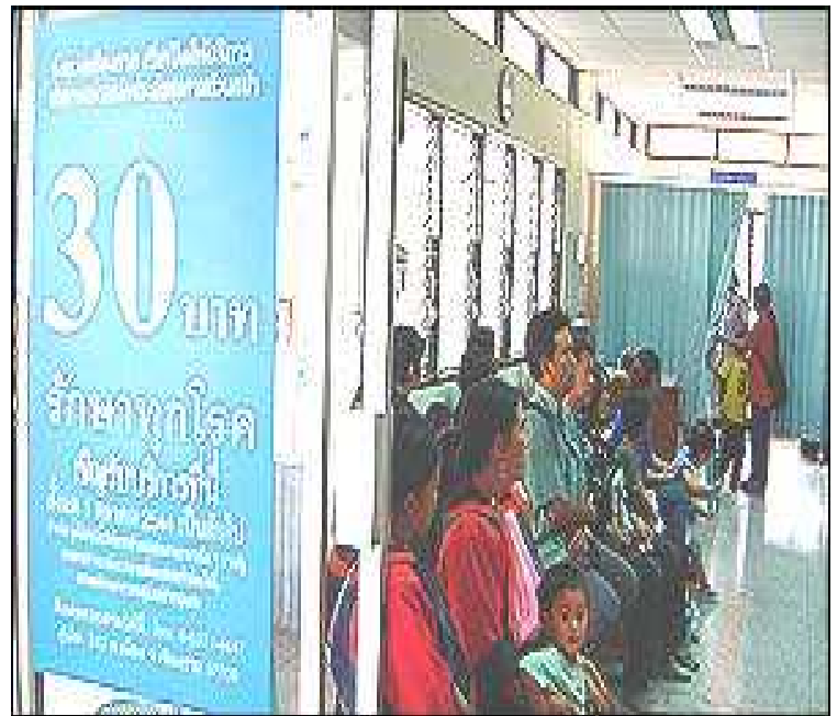
Signs Advertise the New 30 Baht Health Scheme.

The new health reform led to a moderate increase in the use of health care among those who previously were uninsured. But the greatest impact affected those who were previously covered by Thailand's Medical Welfare program, particularly mothers and infants.